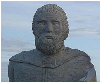
Sir William Henry Sinclair