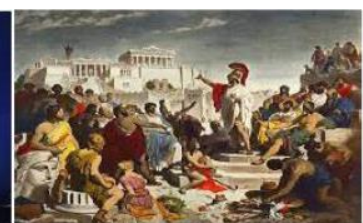
Featuring the Return of Cleopatra who in a previous incarnation assisted Alexander the Great rid the knowr world of un-welcome monsters as his shape shifting horse.